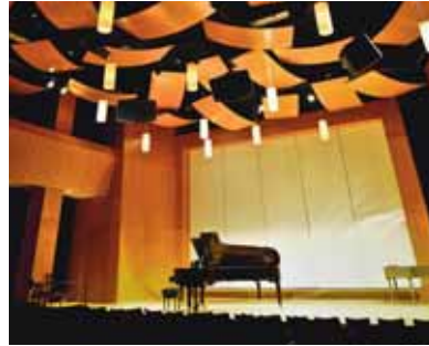
The stage at Antonello Hall in MacPhail Center for the Arts.

The Bakken Trio chamber ensemble mixes it up with dance, theater and percussion this season in its new venue, the gorgeous Antonello Hall in MacPhail Center for the Arts (501 Second Street in downtown Minneapolis near the Mill City Museum and the Guthrie Theater). The 30-year old chamber music group imaginatively uses its new format of curator-designed music experiences to forge an eclectic series bursting with flavor and sensation.